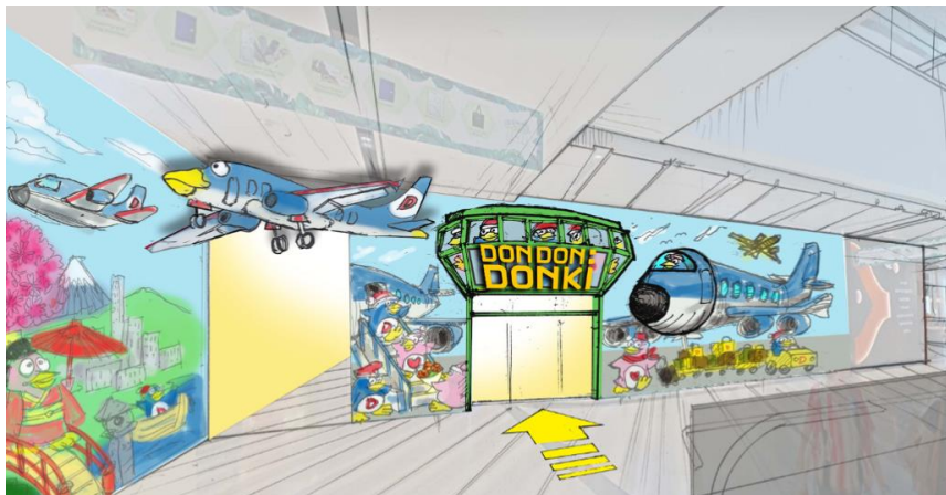
Reference image for Jewel's DON DON DONKI store

SINGAPORE, 11 January 2022 – DON DON DONKI and Jewel Changi Airport Devt. today announced plans for the Japanese lifestyle brand to open a store in the Eastern part of Singapore at Jewel Changi Airport (Jewel). Slated to be one of the brand's largest outlets in Singapore, the store at Jewel spanning 18,000 sqft will be located at Basement One. It is expected to open its doors in the first quarter of 2023 and will add to Jewel's multi-faceted suite of lifestyle offerings.